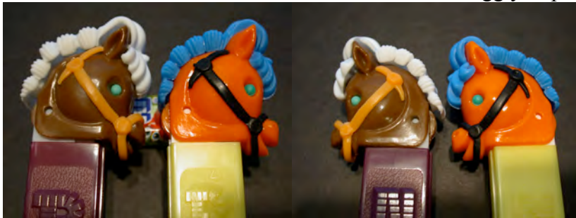
Loose fit on fake, snug on real small eye fake

Ponies – the first and most obvious thing to look for is the fit of the mane. It should fit snugly around the head of the pony. Look also at the size of the eyes. The fake pony eyes are much smaller. Check the fit of the bridle – it should fit snugly in place around the nose.