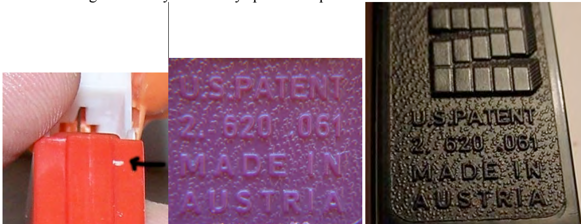
Nick on stem

2.6 Austria stems – there are two different versions of the fakes. One has a nick mark 1/8” below the top edge on the right as you look at it, just beside the center seam ridge. There is also a nick on the back of the stem, approximately half way down, on the left of the center seam on the ridge. The pebbling is distinctly different but harder to see than on the second version which is most distinguishable by the widely spaced dot pattern.